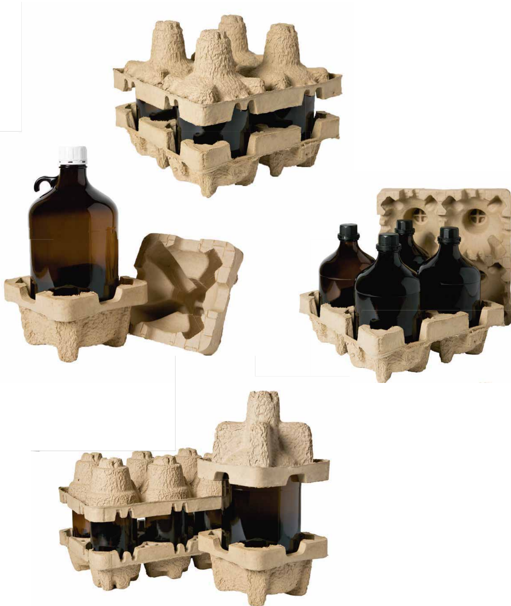
Material: 100% recovered paper and cardboard